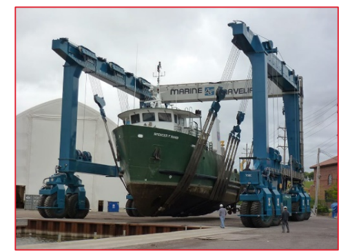
Photo representation of type of potential work. Not current TAM projects